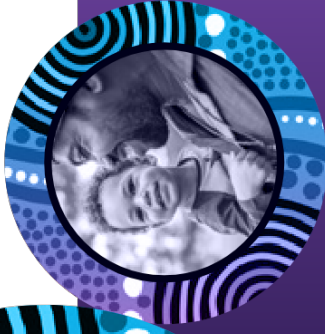
ABOVE: An element of Cliftons ESC website page. LEFT: Cliftons social post for Reconciliation Week, May, 2023.