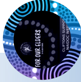
Cliftons social post for NAIDOC Week, June 2023