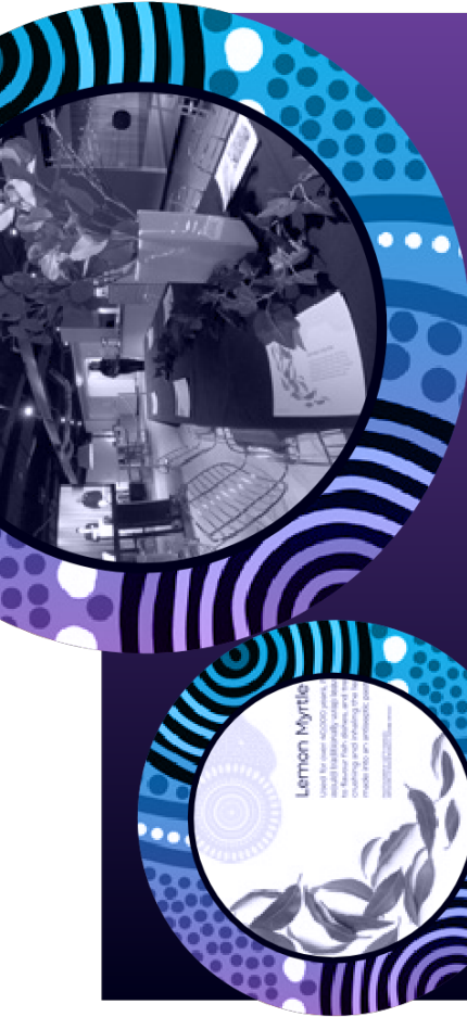
LEFT: Our venues offered catering using Australian native ingredients ABOVE: National Reconciliation Week was celebrated at Cliftons Sydney and Melbourne venues, May 2023.